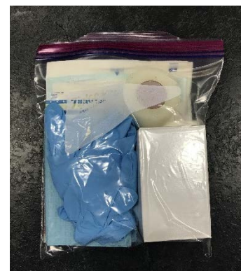
Completed First Aid Kit

This is an easy project for all ages and helps so many people around the world! Have fun!